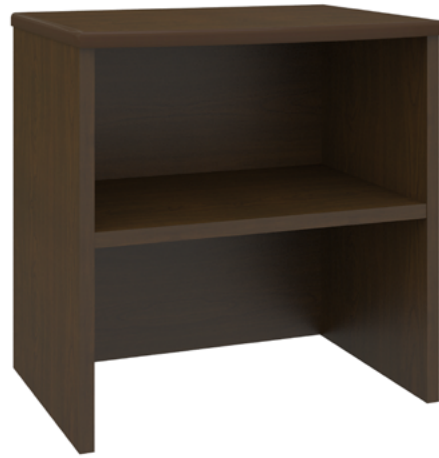
Model: EXBH 20.5W 11.75D 20H

The contemporary Essex collection features a distinctive leg design providing a dimensional look that allows for easy cleaning. Select tone-on-tone or contrasting wood-grained finishes for legs and top. Customizable and available in a variety of sizes. Sophisticated hardware delivers added style.